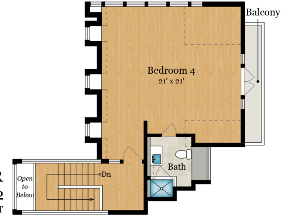
UPPER LEVEL 2 635 SQ FT