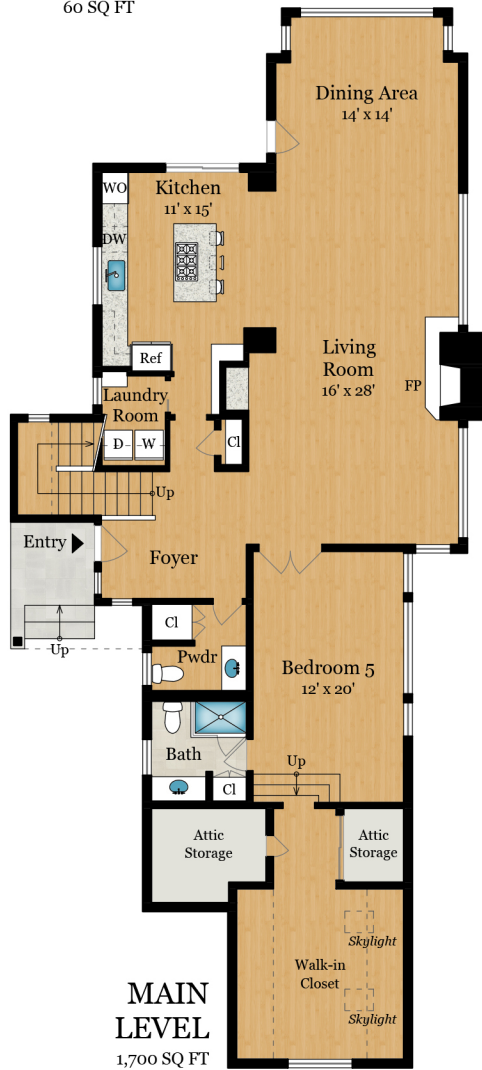
MAIN LEVEL 1,700 SQ FT