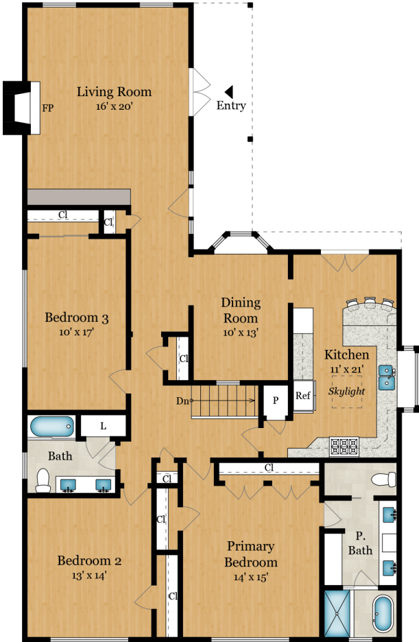
MAIN LEVEL 1,950 SQ FT

* Estimated Total Finished & Unfinished Square Footage: 3,740 SQ FT